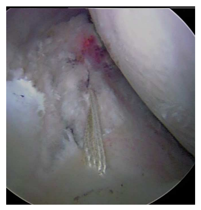
Figure 5 Suture placed for plication of the capsule.

In one study, 10 PGA professional golfers and 6 low-handicap amateur golfers who were diagnosed with labral tears and capsular redundancy underwent laboratory testing of strength, proprioception, balance, flexibility, and swing-motion analysis with electromyogram.<sup>20</sup> A decreased hip abduction moment was found in injured golfers, when compared with healthy controls. An unpublished study (Lephart, Philippon and coworkers presented at the 2002 World Scientific Congress of Golf, St. Andrews, Scotland, July 26, 2002) further showed that coactivation of the hip abductors and adductors resulted in hip stabilization and a lower displacement force. The results of these studies illustrate the importance of hip musculature in hip stability and overall golf performance. Bharam and coworkers