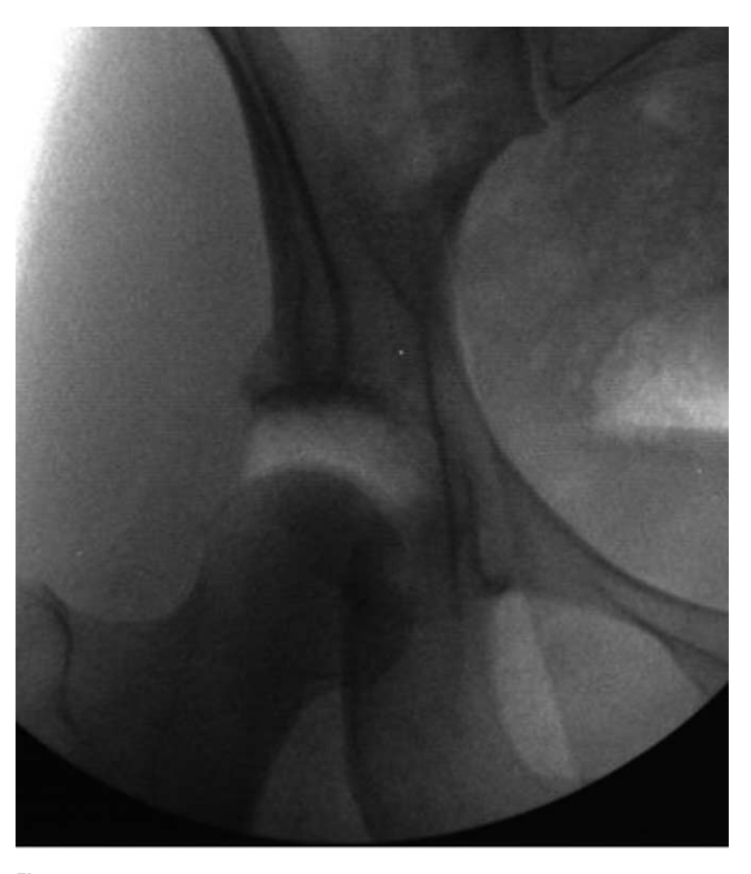
Figure 3 Fluoroscopy showing increased capsular volume and excessive axial distraction.

A previously reported supine position is used for hip arthroscopy, and portals are placed anterior, anterolateral, and distal lateral.<sup>29,30</sup> Specialized long, flexible radiofrequency probes have been specifically designed for use in the hip joint (Smith+Nephew, Andover, MA). The thermal capsulorrhaphy procedure used in the hip has been reported previously.<sup>2,16</sup> The area of redundancy is first identified, and the probe is moved across the tissue in a striped pattern (Fig. 4).<sup>31</sup> Tissue response is closely monitored in the color of the tissue (heated tissue appears more yellow and flatter) and in the visual shrinkage of the tissue. It has been shown that adequate tissue must be left between the stripes to allow fibroblasts, which are killed in the treated regions, to repopulate the area.<sup>26</sup> We believe that thermal capsulorrhaphy is a safe and effective treatment for