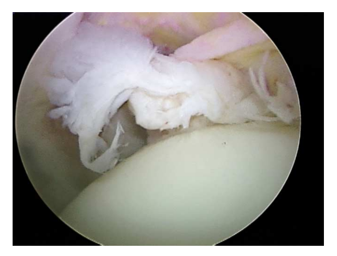
Figure 6 Arthroscopic view of a torn ligamentum teres.

Injuries to the ligamentum teres have been a documented source of intractable hip pain in athletes, including ballet dancers, figure skaters, and martial artists.<sup>3,38</sup> Although tears of the ligament can be the result of traumatic dislocation in any sport, they more commonly have an insidious onset. Repetitive external rotation of the hip and axial loading may cause capsular